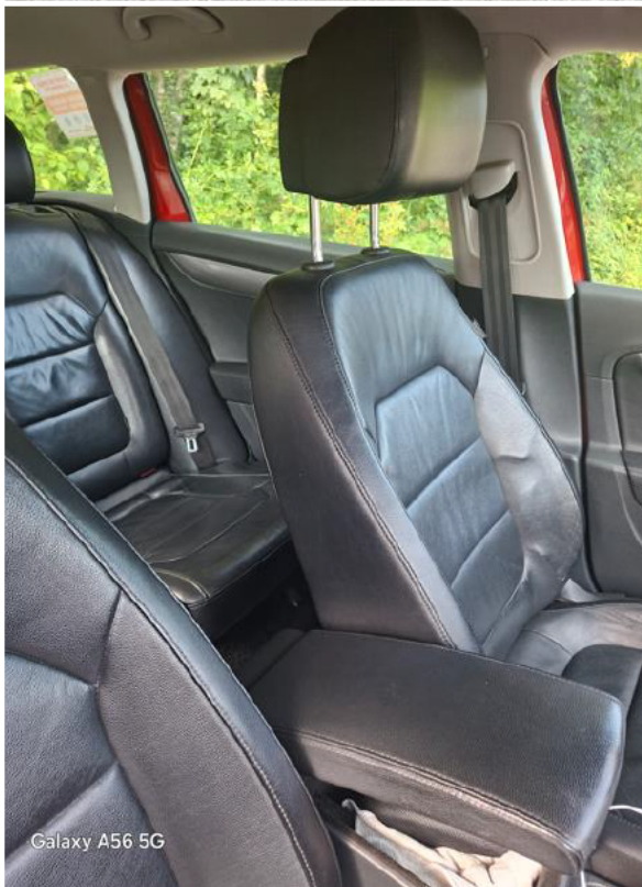
Galaxy A56 5G